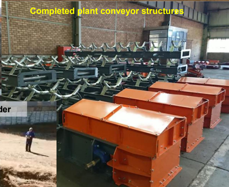
Completed plant conveyor structures