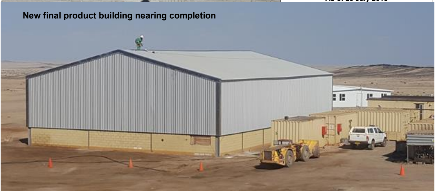
New final product building nearing completion