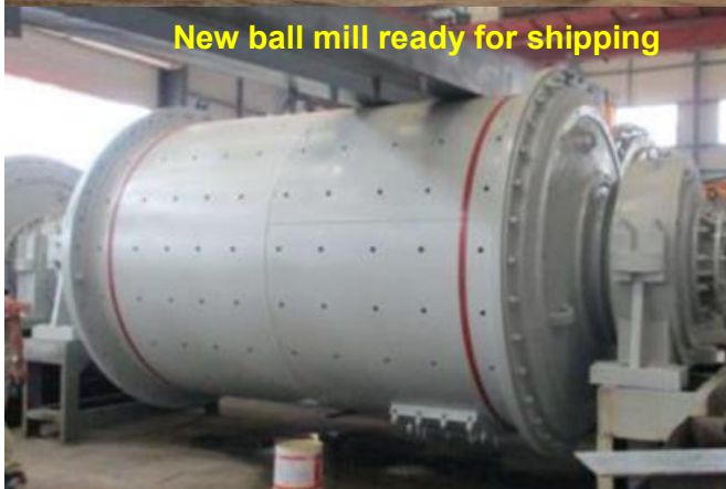
New ball mill ready for shipping