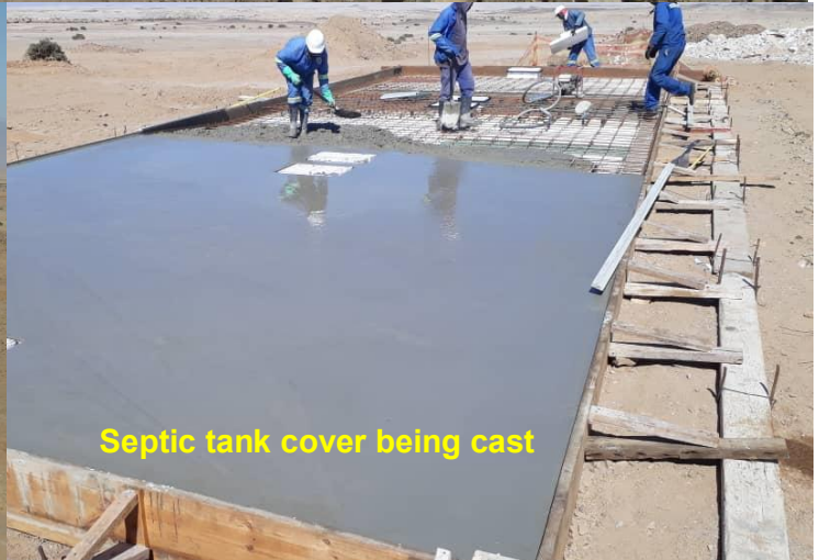
Septic tank cover being cast