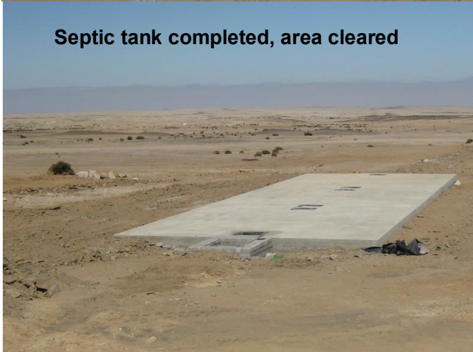
Septic tank completed, area cleared