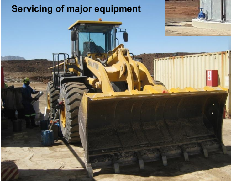
Servicing of major equipment