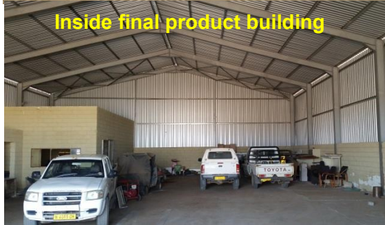
Inside final product building