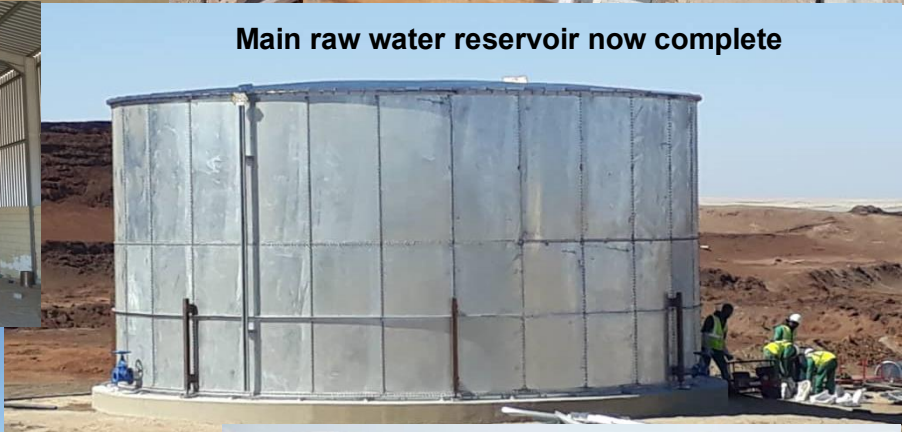
Main raw water reservoir now complete